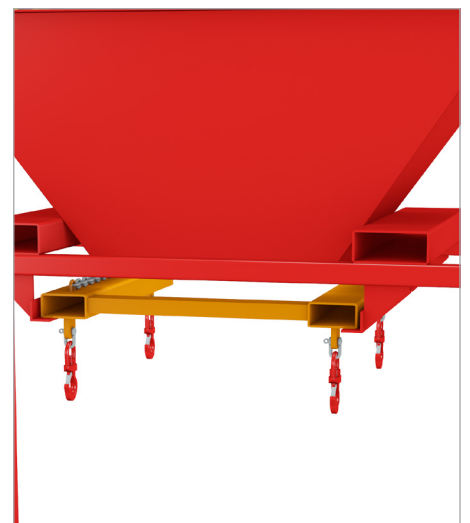
BTM with fixture for Traverse TBB-W