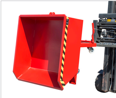
MGU with castors