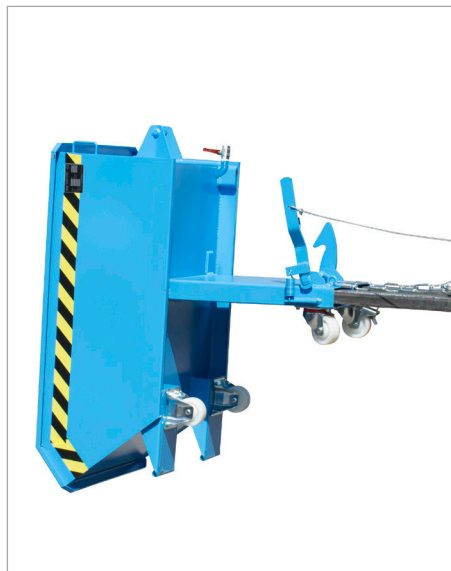
SMGU with castors

Extremely low construction height. Ideal for use under cutting machines that create swarf.