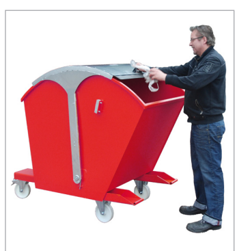
RD with castors