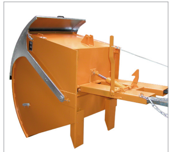
RD with dumping brake